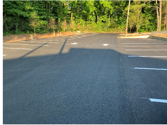
South Elevation Pavement