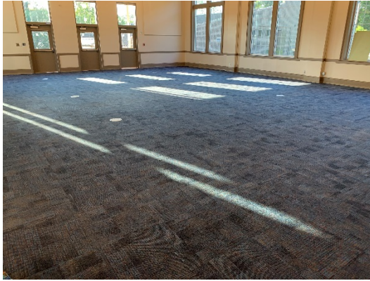
Media Center Carpet