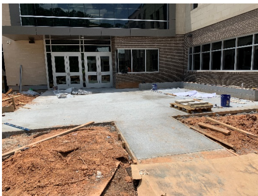
Concrete At The Main Entrance