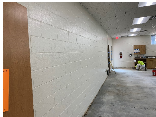
Final Coat of Paint in Building 2050